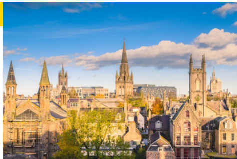
Walking Tours in Aberdeen

Walking Tours in Aberdeen offers accessible routes for wheelchair users and adapts tours for those with visual impairments by providing verbal descriptions. They avoid obstacles like cobble streets and dropped curbs where possible. Visitors with specific needs, such as requiring a helper or additional details, are encouraged to contact in advance for a tailored experience.