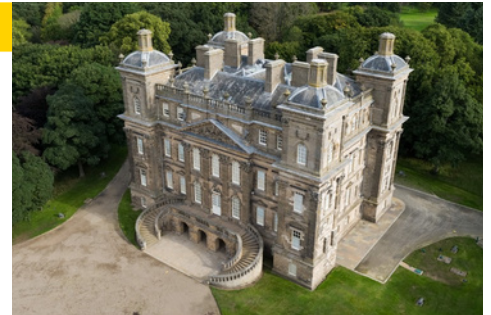
HES Duff House

Duff House in Banff offers accessible features including a gravel path to the entrance, wheelchair-accessible parking, and a lift to upper floors. The side entrance provides an alternative to the steps at the main entrance. Visitors can enjoy an introductory audio-visual presentation, though it is not subtitled. Carer discounts are also available.