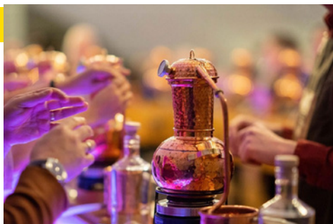
City of Aberdeen Distillery

The Gin School offers an inclusive experience with level access, a wheelchair-friendly sales counter, and a custom-built wheelchair table for events. The venue has a wheelchair-accessible toilet and can provide large print materials or verbal descriptions of botanicals upon request. Quieter sessions are available for those who prefer a less crowded environment. The distillery also offers early entry and adapted event set ups to accommodate mobility needs, with staff available for assistance.