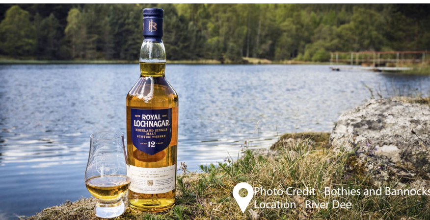
Location - River Dee